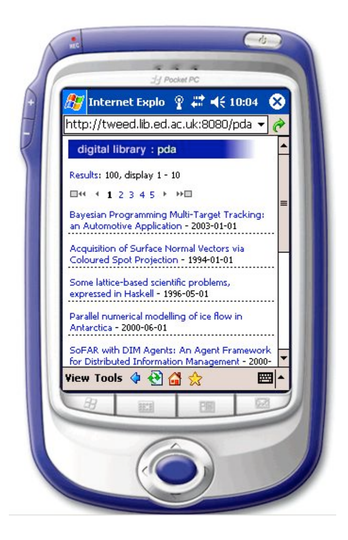
Fig. 2. A PDA portal based on the ELF service (http://tweed.lib.ed.ac.uk:8080/pda)